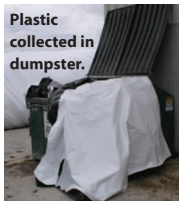
Plastic collected in dumpster.

Joe Van Rossum, Solid and Hazardous Waste Education Center, 608-262-0936