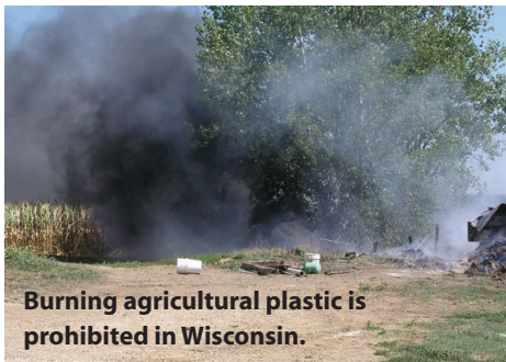
Burning agricultural plastic is prohibited in Wisconsin.

Plastic films are used extensively for silo bags, bunker covers, bale wraps, and horticultural mulch. Managing large, dirty plastic sheets is a major headache and cost for Wisconsin farmers. Until recently, the only legal disposal option for most farmers was landfilling. These plastic films, once largely unusable resources, can now be recycled into other plastic products.