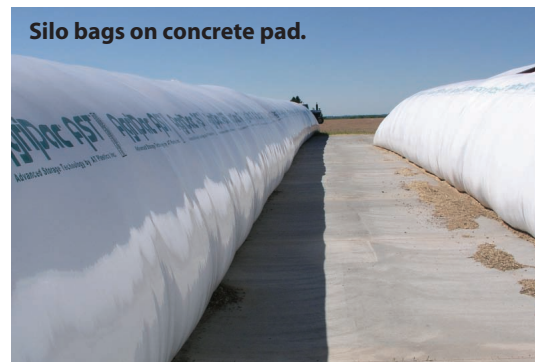
Silo bags on concrete pad.