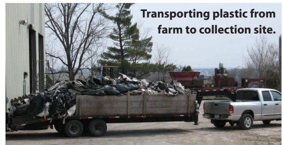
Transporting plastic from farm to collection site.

Copyright © 2009 by the Board of Regents of the University of Wisconsin System doing business as the division of Cooperative Extension of the University of Wisconsin-Extension. All rights reserved. Send copyright inquiries to: Cooperative Extension Publishing, 432 N. Lake St., Rm. 231, Madison, WI 53706.