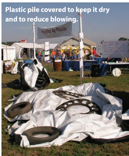
Plastic pile covered to keep it dry and to reduce blowing.