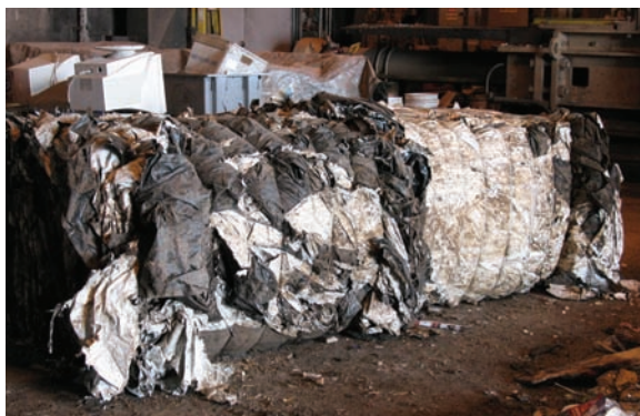
Agricultural plastic film baled and ready for transport to recycling facility.