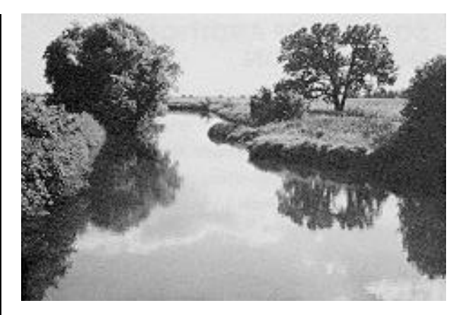
Conservation organizations' support and involvement increases landowner use of conservation practices that benefit fish and wildlife.

tat. Interested conservation groups could donate money, materials and labor to add trees and shrubs that provide food and cover for more wildlife species.