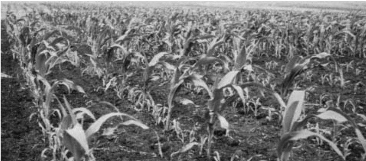
Figure 3. Early plants mixed with 3-week delayed plants in the season