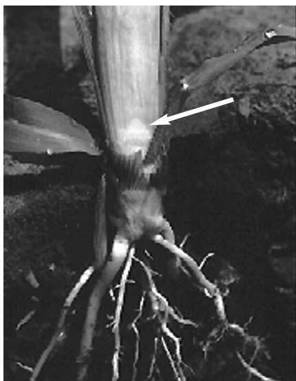
Figure 1. On healthy plants, the growing point is yellowish white.

The growing point of the corn plant remains protected below ground 2 to 3 weeks after emergence (figure 1). To evaluate the condition of the growing point, split the stem down the center with a knife. A healthy growing point will be yellowish-white and firm. Decayed, discolored tissue indicates a dead plant. Plants that are of questionable health should be counted as a half-plant when assessing the stand.