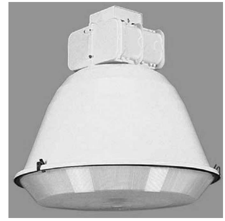
Figure 2. Standard CLF should not be used in livestock housing unless it is installed in a sealed fixture.

Figure 4. Low-bay HID fixtures are used in freestall barns.