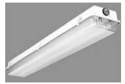
Figure 1. Sealed fluorescent fixtures should be used in animal housing or milking parlors.

Generally, T-12HO fixtures are used in cold locations (<50°F) which is unnecessary if the correct T-8 ballast has been selected since the T-8 ballasts are designed to work down to 0°F with a few exceptions (check package labeling).