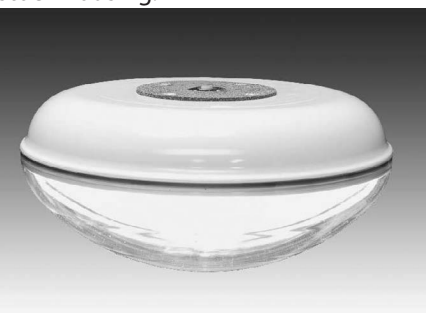
Figure 4. Low-bay HID fixtures are used in freestall barns.

Figure 3. Some manufacturers have developed specialized CFLS for livestock housing.