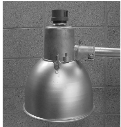
Figure 5. Hubbel skycap reflector increases light reaching the ground.

the fixture to be used to determine the fixture spacing for the required lighting level.